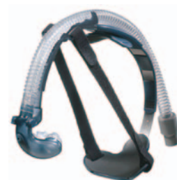
Breeze SleepGear With DreamSeal Assembly